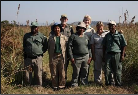
Figure 2 – The egg counting team in 2017.