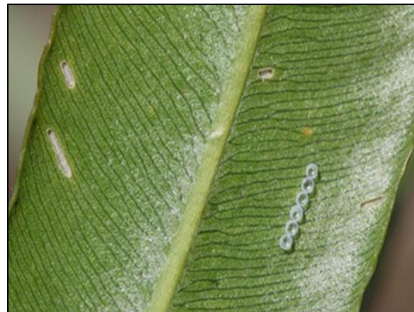
Figure 1 – Hatched C. millari eggs and typical larval feeding signs.

C. millari eggs and the fronds for the characteristic larval feeding signs (Fig. 1). The Ezemvelo KZN Wildlife staff who participated in the 2017 egg count are shown in Figure 2. The C. millari egg count at Dreadnaught Peak Farm (DPF) took place on 11 May 2017 and 2018.