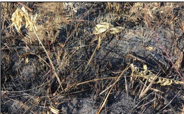
Figure 8 – Burnt Stangeria eriopus cycad.