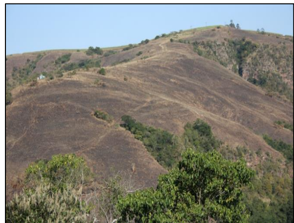
Figure 6 - The Stangeria eriopus colony is established on the lower part of the ridge over which the arson fire swept.

The egg count on DPF on 11 May 2018 recorded no eggs nor characteristic feeding signs from a total of 142 S. eriopus cycads within the monitoring site. Although the 2017 fire likely decimated this population, recolonization might take place from ENR. Continued egg monitoring at ENR and DPF will enable long term trends to be ascertained.