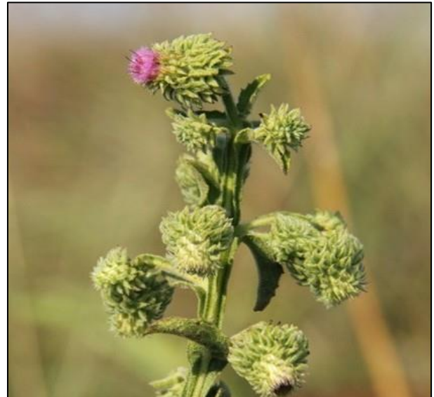
Figure 4 – Blumea dregeanoides .