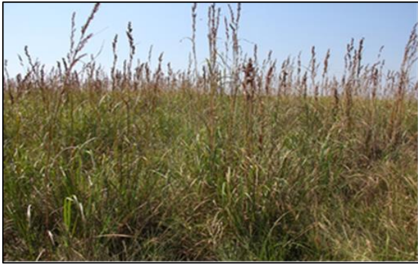
Figure 11 - Encroachment of C. validus within Entumeni Nature Reserve.

Woody encroachment facilitates forest margin expansion. Miscanthus capensis (Nees) Andersson (Daba Grass) observed at the monitoring site adjacent to the V. karroo encroachment could indicate increased soil moisture levels that might favour woody plants. Mechanical and chemical management of V. karroo , P. aquilinum , Rubus cuneifolius Pursh (American Bramble) and Acacia melanoxylon R. Br. (Australian Blackwood) is required, the latter two species being invasive alien plants specific to the grasslands.