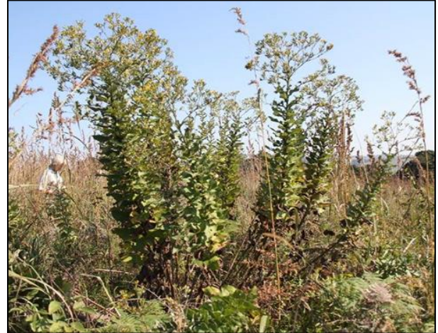
Figure 3 – A robust S. panduriformis with similar growth form to Vernonia myriantha Hook. f., a popular nectar plant at Entumeni Nature Reserve.