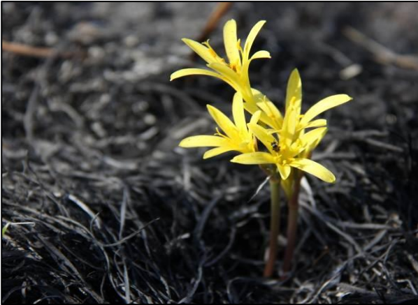
Figure 7 – Cyrtanthus breviflorus .

The monitoring sites at ENR and DPF should only be burnt later in the season (at the end of August or in September) to minimise the risk of decimating the numbers of C. millari there.