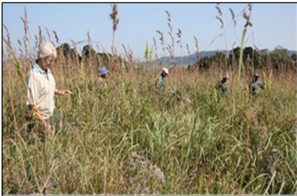
Figure 5 – Conducting line sweeps through tall Cymbopogon validus -dominated grassland.

Legend: * = unhatched eggs; Feeding = evidence of larval feeding