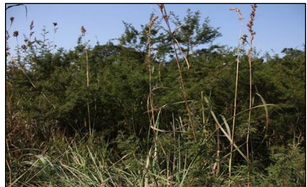
Figure 10 – Vachellia karroo encroachment at the monitoring site.

The tall, rank grasslands were in need of burning in 2017. Fire plays an important role in grassland management at the ENR. Reduced fire frequency in the past resulted in the encroachment of indigenous Maesa lanceolata Forssk. (False-assegai) trees into the grasslands. This encroachment was controlled using cut-stump herbicide treatment. Vachellia karroo (Hayne) Banfi & Galasso (Sweet Thorn), C. validus and P. aquilinum continue to encroach into the grasslands (Figs 10 & 11).